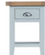
40 x 32 x 55 £125 (SIT)