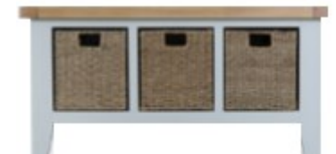
100 x 35 x 50 £225 (LHB)