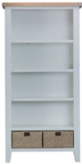
90 x 30 x 180 £455 (LBC)