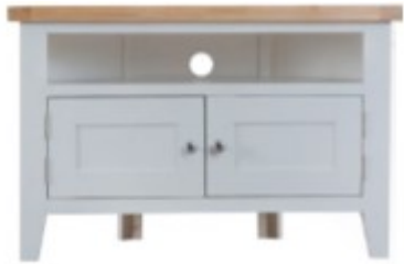
100 x 50 x 65 £335 (CTV)