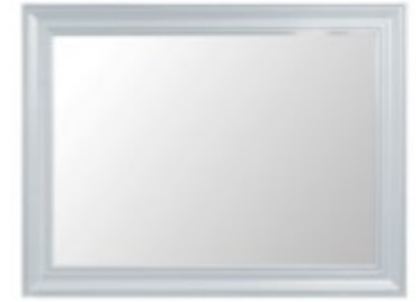
120 x 30 x 90 £165 (LWM)