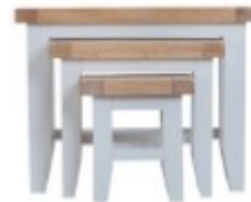
65 x 38 x 55 £235 (N3T)