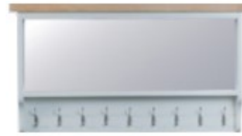
100 x 15 x 50 £165 (LHBT)