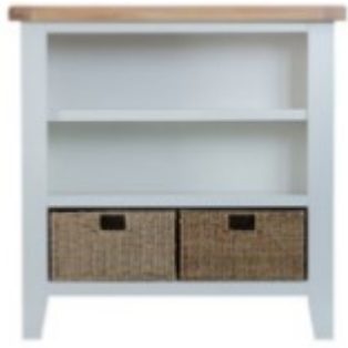
90 x 30 x 90 £295 (SWB)