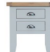
50 x 50 x 55 £195 (LT)