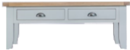
120 x 60 x 45 £335 (LCT)