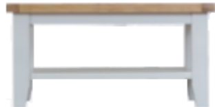
90 x 50 x 45 £195 (SCT)