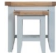
50 x 35 x 50 £165 (N2T)