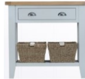
86 x 35 x 80 £275 (CON)