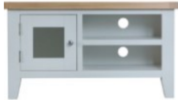
100 x 40 x 55 £255 (STV)