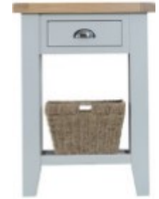
55 x 30 x 75 £185 (TEL)