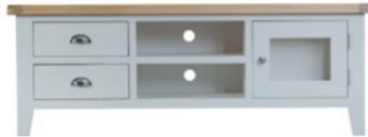
150 x 40 x 55 £395 (LTV)