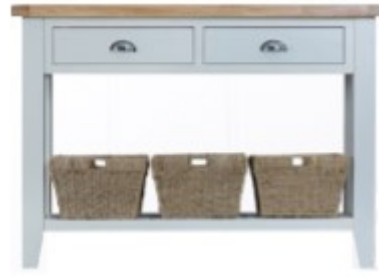
120 x 35 x 85 £355 (LCON)