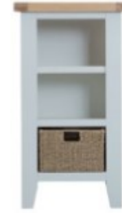
50 x 30 x 90 £195 (SNB)